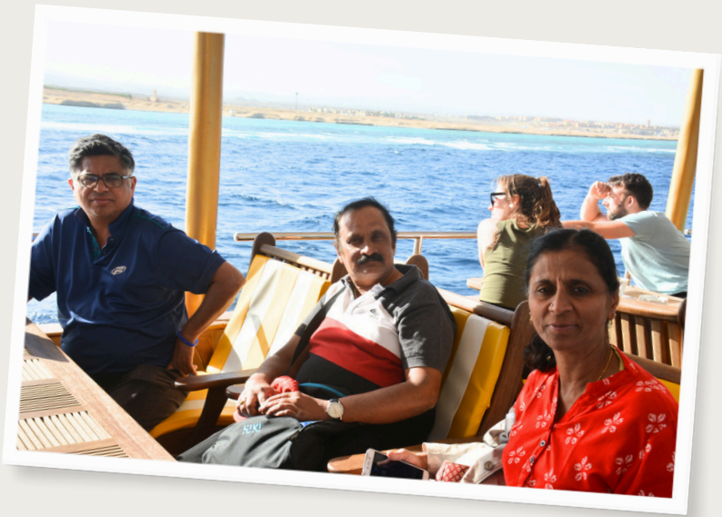
Spending some quality time with husband in Egypt.