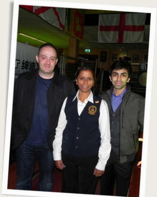
World Billiards Champion Mike Russel and our Star Pankaj Advani

Her victory at the World Billiards Championship sent a powerful message of hope and encouragement to all women who harbored a passion for cue sports, reaffirming that dreams can indeed be pursued and realized.