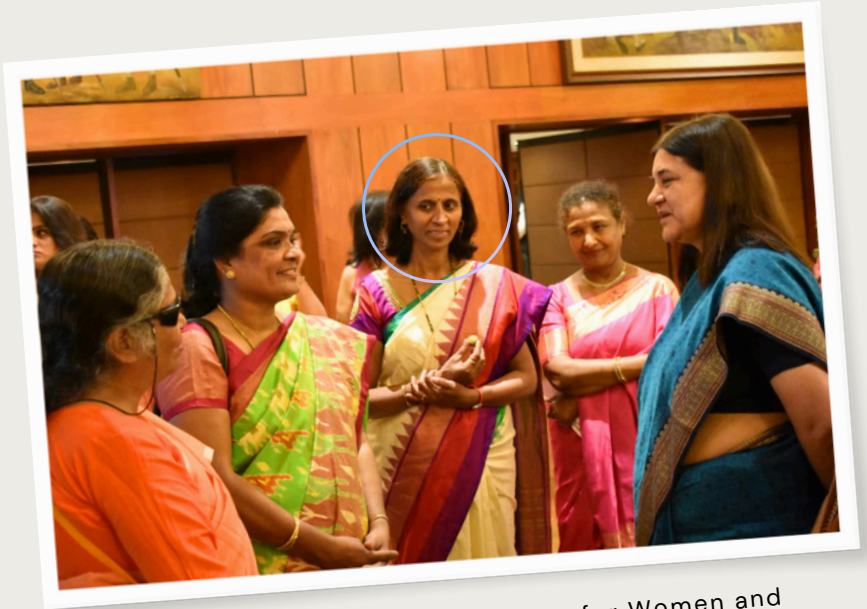
With Smt. Maneka Gandhi, Minister for Women and Child Development Department, along with other Nari Shakti Puraskar recipients.