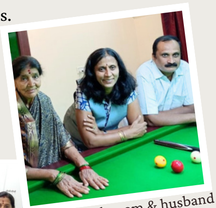
With mom & husband