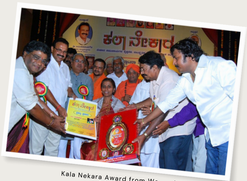
Kala Nekara Award from Weaver's Community

These awards not only celebrate her exceptional contribution to Indian sports but also serve as an inspiring example for young women, encouraging them to embrace cue sports as a viable pursuit.