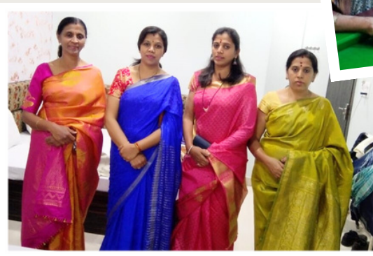
With my sisters