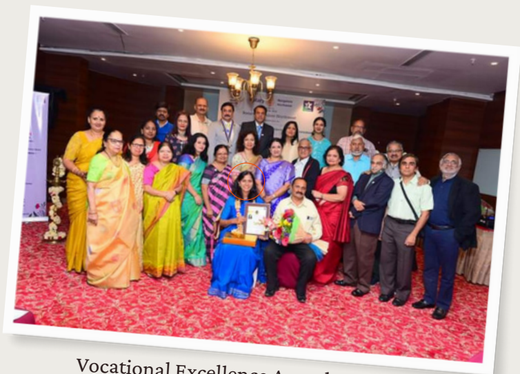
Vocational Excellence Award 2022