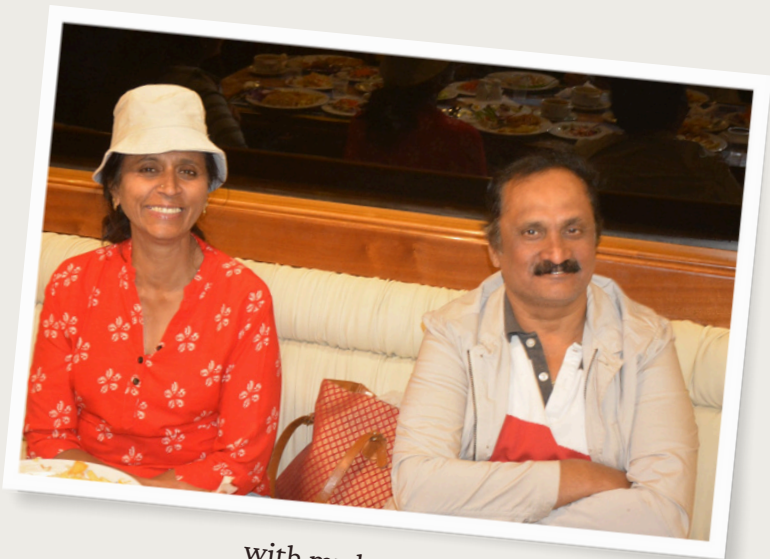
with my husband

He stood by her side, offering unwavering encouragement and support throughout her journey, regardless of her wins or losses. Through all the ups and downs of her life, he remained her steadfast pillar of support. She always credited him for every victory she achieved.