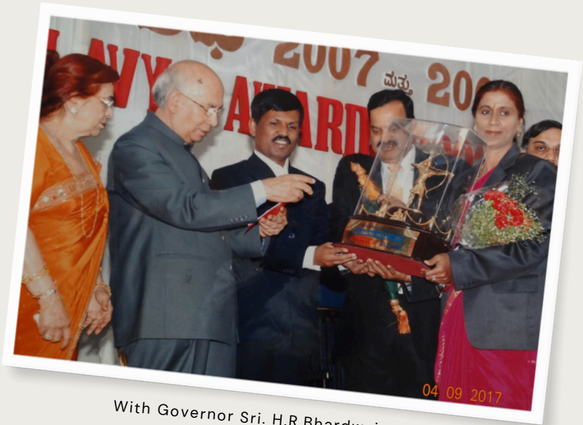
With Governor Sri. H.R. Bhardwaj receiving Eklavya Award - 2007