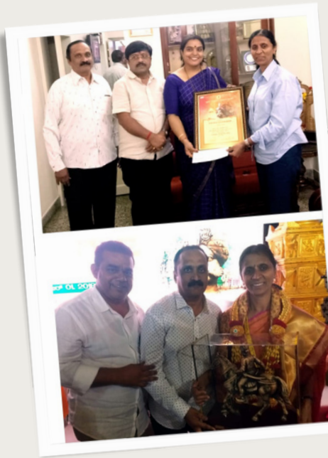
Sri Kempegowda Award 2018